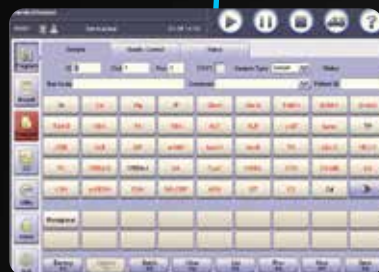
Intelligent software with user-friendly interface