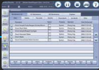
Step-by-step maintenance guide