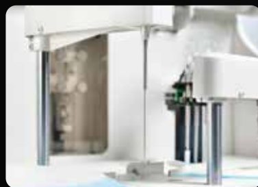
Independent mixing bar