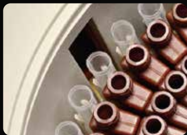
Built-in barcode reader