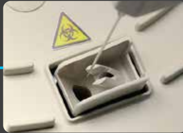
Waterfall probe cleaning